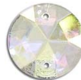
SJ20MM/301 20mm cristal AB AB crystal