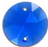
SJ20MM/224 20mm saphir sapphire