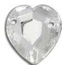
SJ11X10/101 11x10mm cristal/crystal