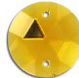
SJ20MM/227 20mm topaze topaz