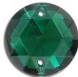
SJ20MM/207 20mm émeraude emerald