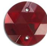
SJ20MM/225 20mm siam siam