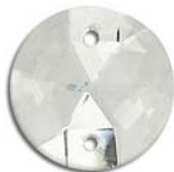
SJ20MM/101 20mm cristal crystal