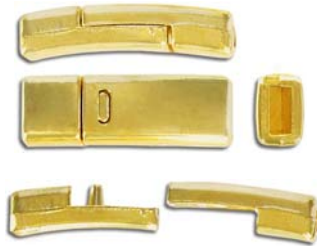
CL62M/GL 27x9mm ID 2x5mm