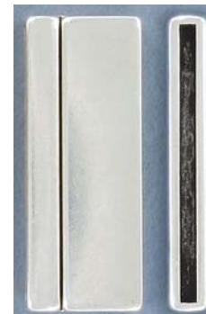
CL254M/WH 17x43mm ID 2.5x40mm