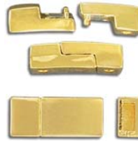
CL63M/GL 16.8x7.3mm ID 5x2mm