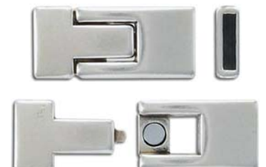
CL144M/OXWH 30x13mm ID 10x2.4mm