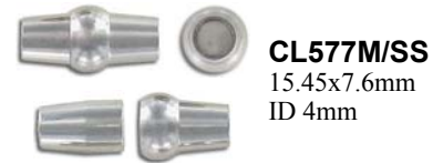
CL577M/SS 15.45x7.6mm ID 4mm