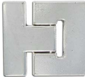
CL82M/OXWH 36x33mm ID 3x30mm