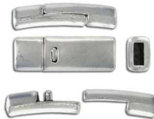
CL62M/OXWH 27x9mm ID 2 x 5 mm