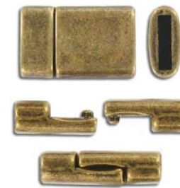
CL55M/OXBR 21x13mm ID 2x10mm