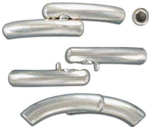
CL26M/OXWH 50x7mm ID 4mm