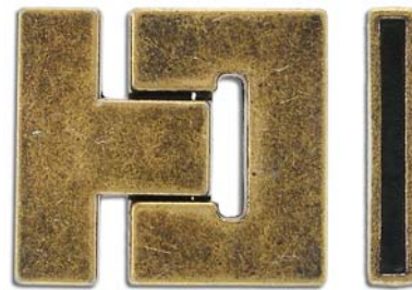
CL82M/OXBR 36x33mm ID 3x30mm magnétique magnetic