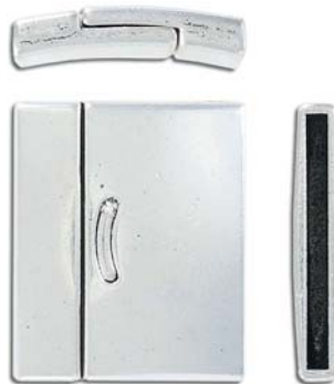
CL59M/OXWH 24x30mm ID 28x2mm