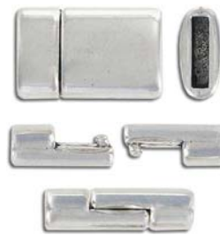
CL55M/OXWH 21x13mm ID 10x2mm