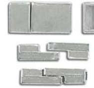
CL63M/WH 16.8x7.3mm ID 5x2mm