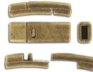
CL62M/OXBR 27x9mm ID 2 x 5 mm