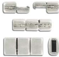
CL694M/OXWH 18x8mm 5x2mm ID