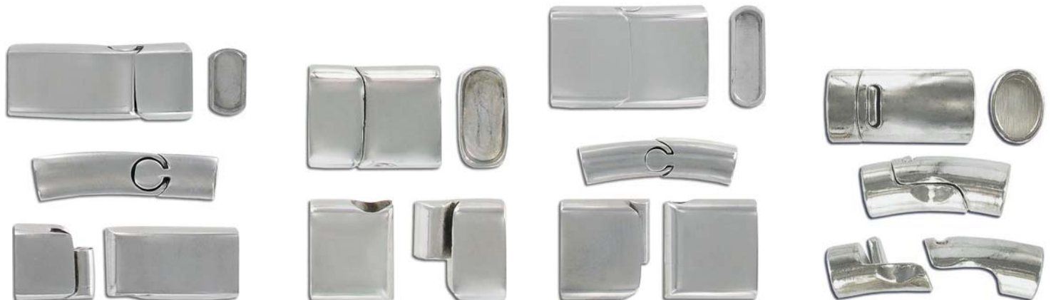
CL719M/SS 32x14mm 12x5mm ID