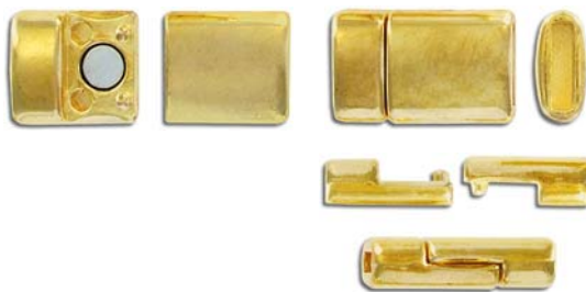
CL55M/GL 21x13mm ID 2x10mm