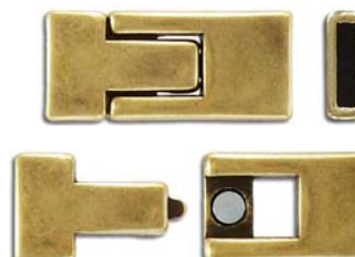
CL144M/OXBR 30x13mm ID 10x2.4mm