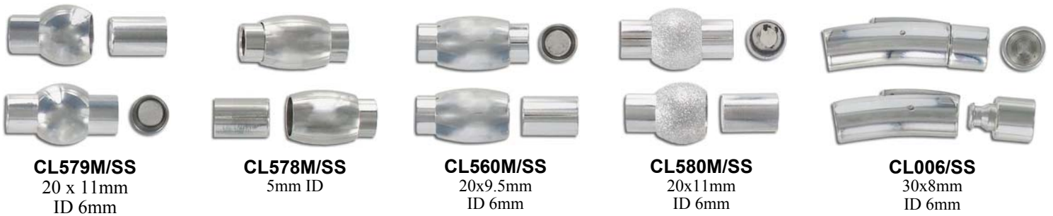
CL579M/SS 20 x 11mm ID 6mm