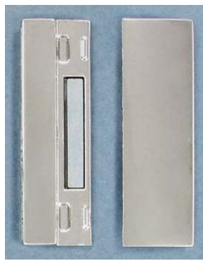
CL90M/WH 20x42mm ID 2.5x39mm magnétique magnetic