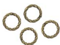
JR8MMF/OXBR 8mm 17ga, (1.2mm)