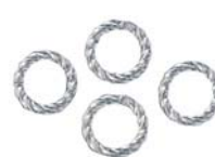
JR8MMF/SPL 8mm 17ga, (1.2mm)