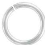
JRA18MM/SPL 18mm 10ga, (2.4mm)