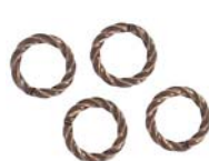
JR8MMF/OXCO 8mm 17ga, (1.2mm)