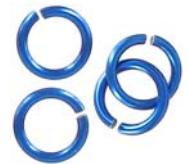
JRA10MM/ROY 10mm 14ga, (1.6mm)