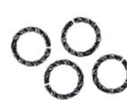
JR8MMF/BN 8mm 17ga, (1.2mm)