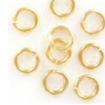
JR5MM09A/HGL 5mm 0.9mm, (19ga) or hamilton hamilton gold made in US