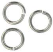
JR10MM/SS OD 10mm 1.5ga, (1.4mm)