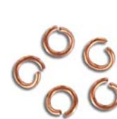
JR6MM/RSS 6mm 18ga, (1mm)