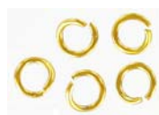
JR6MM/GSS 6mm 18ga, (1mm)