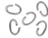
JR7X5MM/SS 7x5mm 19ga, (0.9mm)