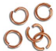
JR8MM/RSS 8mm 17ga, (1.2mm)