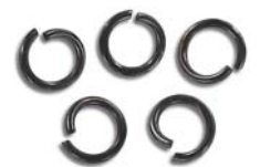
JR8MM/BSS 8mm 17ga, (1.2mm)