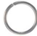
JR16MM/SS 16mm 14ga, (1.6mm)