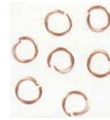
JR5MM07/RSS 5mm 21ga, (0.7mm)