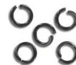
JR6MM/BSS 6mm 18ga, (1mm)