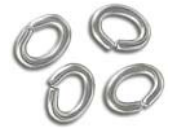
JR8X6MM/SS 8x6mm 15ga, (1.5mm)